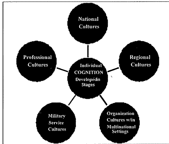
Figure 3 Cognitive Underpinings of Cultural Awareness in the Military Megaorganization

cultural awareness and soft power just described, this article now explores the concept that there is a symbiotic relationship between cultural manifestations and cognitive patterns. The article will then examine the role of culture in shaping attitudes and attributions. Finally, the influence of culture on a leader's thinking is illustrated by its impact on different aspects of communication and decision-making.